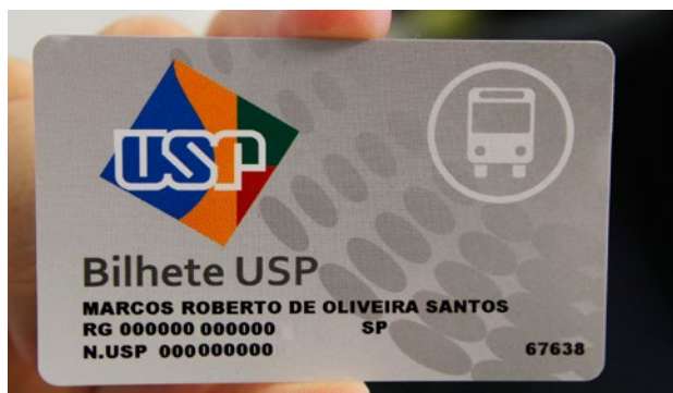
Figure – BUSP

BUSP Card: USP offers the BUSP card that allows free travel on the internal bus lines that connect Cidade Universitária and the Butantã Metro Station (for example, free access to bus lines 8012, 8022 and 8032 Cidade Universitária – Metrô Butantã). Check the link https://puspc.usp.br/uso-do-campus/transportes-3/ for information on routes and operating hours. The BUSP has a recognition chip attached to your name and USP number and is personal and non-transferable. Vehicles that accept the BUSP have the inscription “This bus accepts USP Ticket”, with the University logo applied to the front, sides and back. All international students enrolled at USP receive a card to access the shuttle buses.