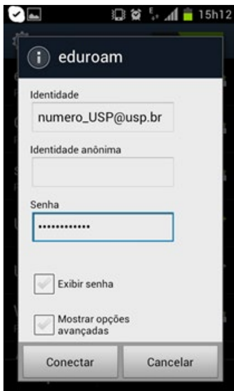
Figure – Screen for connecting to Eduroam Source: https://eduroam.usp.br/wp-content/gallery/roteiros/screenshot_2013-07-26-15-12-21.png

eduroam.usp.br/ or https://eduroam.usp.br/como-usar/ or look for a professional from the IT Technical Service, on the first floor of EEUSP.