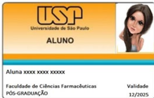
Figure – Physical USP card - Source: https://sites.usp.br/fft/wp-content/uploads/sites/1251/2023/03/Cartao-USP-FCF.jpg

The USP digital card (e-Card USP) can be made available through an app available in the Apple and Google Play stores and accessed using the USP user's unique password. In addition to the image on the mobile device, the USP e-Card features the new use of a QR-Code, which is a temporarily updated security key for user identification when accessing the University's corporate systems.