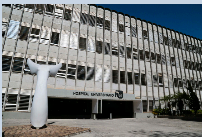
USP University Hospital