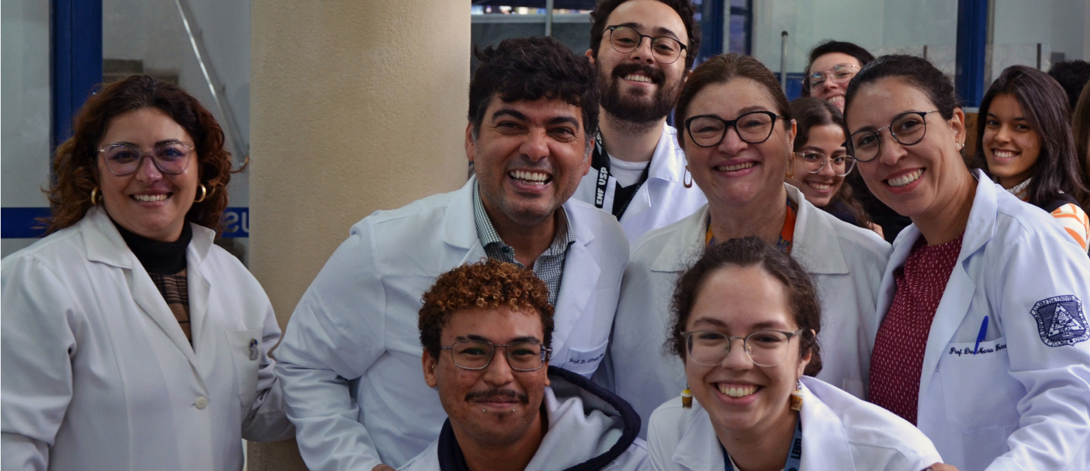
Professors and students at EEUSP