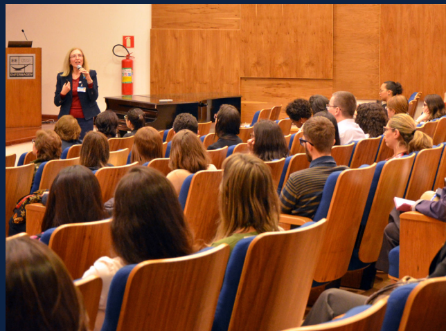
Inaugural class in the Maria Rosa Sousa Pinheiro auditorium

Our approach to the highest level of Nursing training both at undergraduate and graduate programmes is distinguished by our significant global collaborations and strong community engagement. This makes the EEUSP an exciting and inclusive environment for international students, who can benefit from experiences in hospitals, community settings, public health, and many others. They can also participate in workshops, lectures, and learning events with students from other health-related courses within the University, fostering a sense of global community and shared learning.