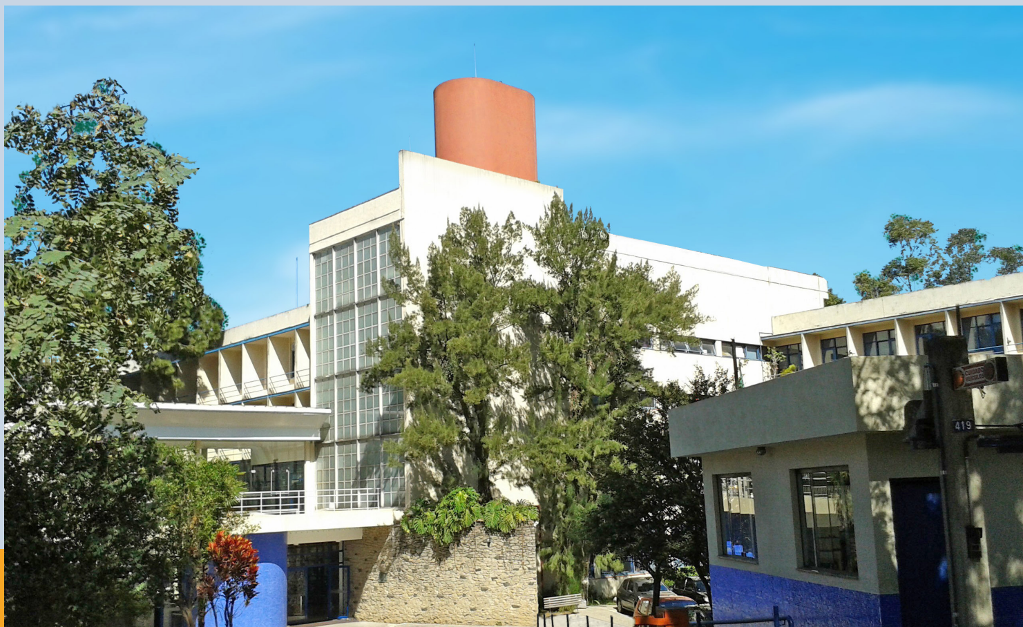
School of Nursing

EEUSP is home to the largest Nursing-related library in Latin America and the Ibero-American Historical-Cultural Centre of Nursing. We offer a comprehensive bachelor's degree Program in Nursing and five Graduate Programs, each with a focus on excellence in research and training. Our areas of expertise include Primary Health Care, Maternal and Infant Care, Mental Health, Nursing Management, Nursing Workforce, Patient Safety, Acute and Chronic Care, and many others.