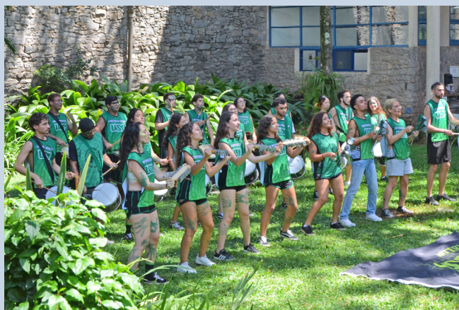
Percussion group - Cultural activity